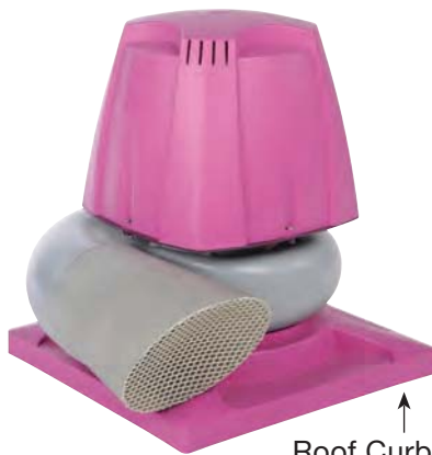
↑ Roof Curb Cap